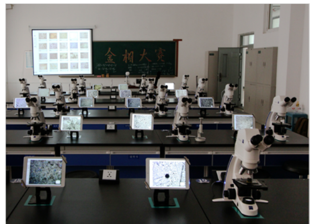
Figure 2 Involving the students supports active learning.

During the education of professions such as medical assistant, dental technician and assistant of veterinary medicine, larger groups of students are required to spend several days per week in a microscopic lab. Learning time is always limited and the course leader often needs to set-up and dismantle the systems in shortest time. The microscopes must be robust and easy-to-use. A digital classroom is a major benefit to course leaders – it allows them to use microscopes that are connected to each other, and digital