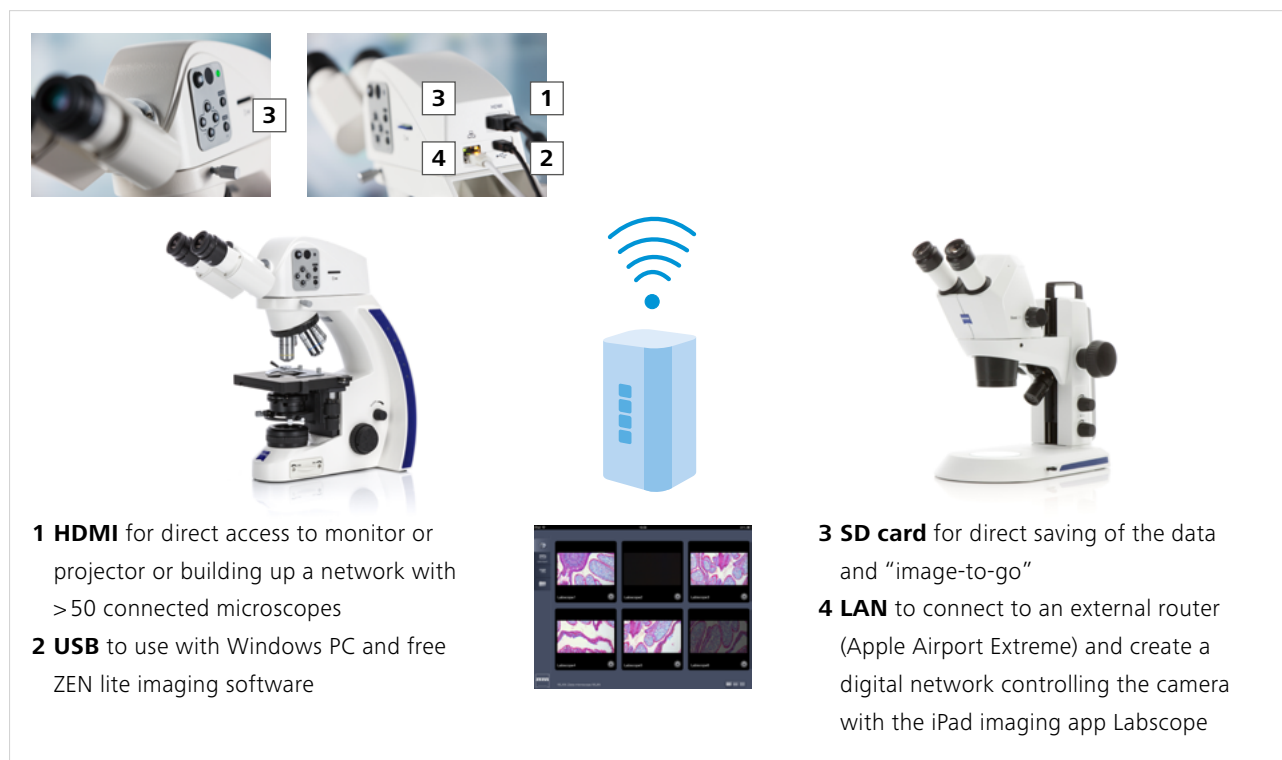
Figure 3 Use the interfaces of ZEISS Primo Star.